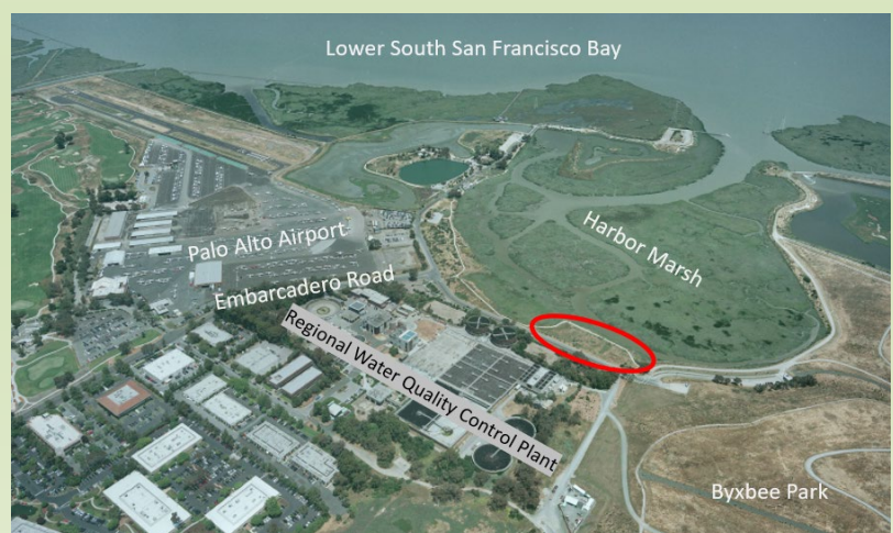
FIGURE 3: Project location (red)

Samantha Engelage, Senior Engineer Samantha.Engelage@paloalto.gov