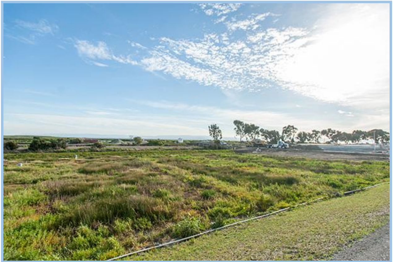
Photo: Horizontal Levee is thriving 2017