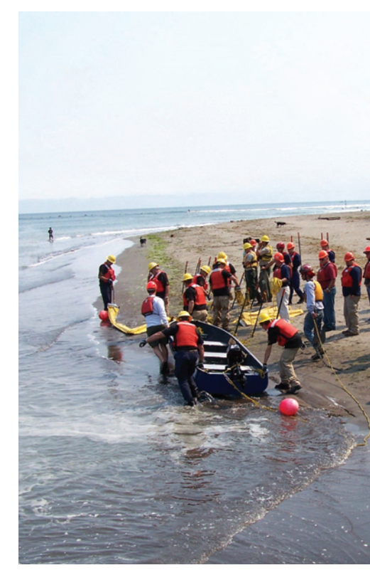
Local, state, and federal agencies test new oil spill response cise after the Cosco Busan spill (July 2008).

In the Dubai Star spill, Schaefer noted inadequate monitoring ("When transferring fuel, the people on the vessel should make sure the flow has stopped") and notification ("a big issue"; the vessel did not make the four required initial telephone calls on time). Noting that the Dubai Star was not pre-boomed during the transfer, he said the currents at Anchorage 9 were too heavy for safe and effective pre-booming. "We haven't found studies on when it's worthwhile to preboom. We're looking at requiring pre-booming until the transfer company can prove they can deploy boom effectively." Schaefer said the Bay's currents were stronger than those in Puget Sound (other, later speakers disputed that statement). Asked what OSPR needs in order to improve prevention, he replied, "That's