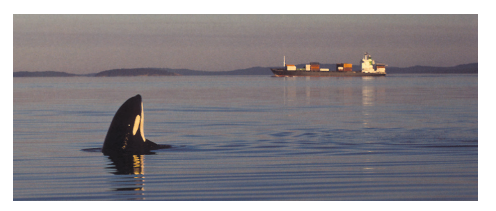
A killer whale in Puget Sound enjoys oil-free waters, thanks to strong spill prevention measures.

Watch some video highlights from the forum at www.sfestuary.org