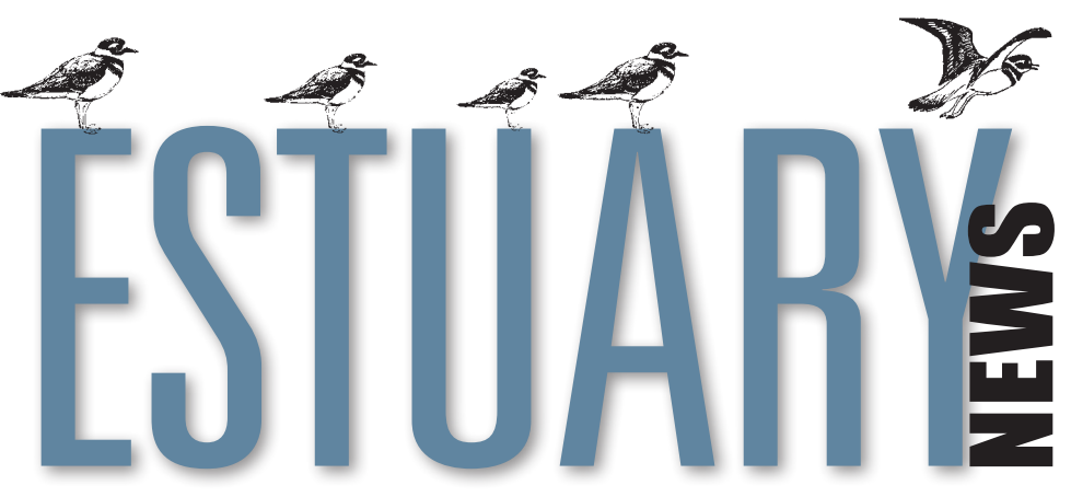
Bay-Delta News and Views from the San Francisco Estuary Partnership | Volume 19, No.3 | June 2010