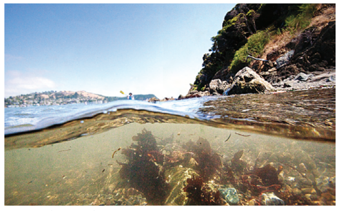
Submerged ("subtidal") habitat in San Francisco Bay is vulnerable to the impacts of oil and can also be harmed during cleanup.

is too much for San Francisco Bay? I hope we take full advantage of this wake-up call. Washington State has a zero-spill goal; that's a good goal for California too."