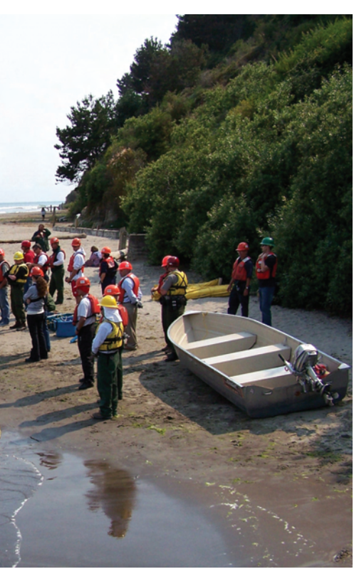
strategies in Bolinas Lagoon in the first full functional exerlarin County Sheriff's Office of Emergency Services