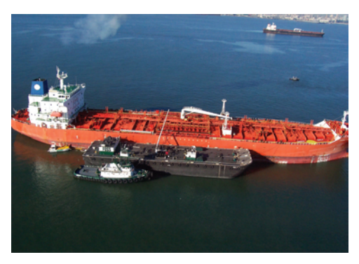
The Dubai Star , refueling at Anchorage 9 in the middle of the Bay.

Case in point: the Dubai Star spill, during a fuel transfer operation at Anchorage 9 in the Central Bay last October. Operators had not set any oil-containment boom around the receiving vessel before the transfer. "Current California regulations require operators to either pre-boom or deploy 600 feet of boom within 30 minutes