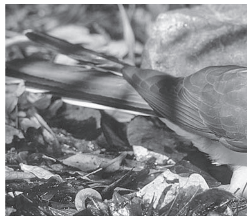
Yellow-billed cuckoo

explains that cottonwoods regenerate extensively after large flood events on the river. "If we were to have proceeded as was proposed