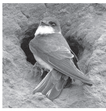
Bank swallow