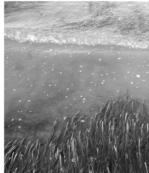
Eelgrass and seeds.