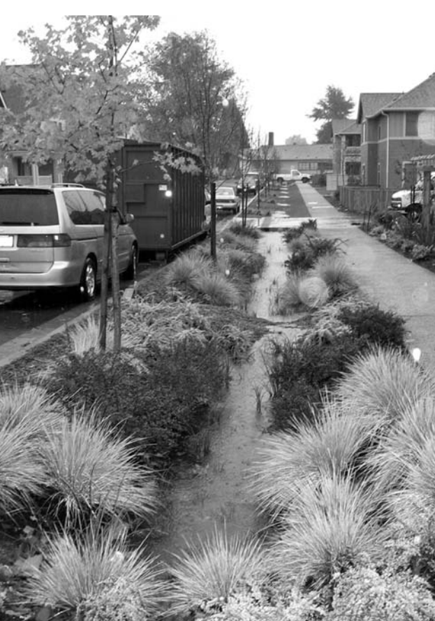
At the High Point redevelopment project, a vegetated swale in the public right-of-way slows and treats runoff.

Two years later, the city moved a few blocks south and ripped out four blocks of a ditch and culvert system, replacing it with a series of vegetated pools that stair-step down a fairly steep hill. This project, known as "110th Cascade,