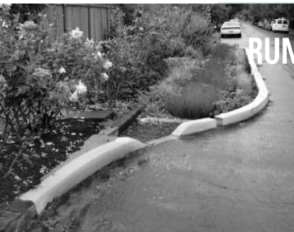
A curb cut directs stormwater into a curb extension "wetland."

Progress is being made to broaden the definition of stakeholders, yet even when everyone is at the table, some partici-