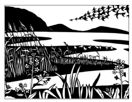
Illustration by Hiroko Kusuda

Adding marsh plants to the mix expands the soil zone where methylation takes place. Visualize a soil sandwich: the top slice with little sulfate- or iron-reducing bacterial activity; the bottom with little available reactive mercury; the filling where the transition from oxic to anoxic conditions allows an optimum balance of the two. By pumping oxygen into the soil, plant roots enlarge that optimum zone. But it works