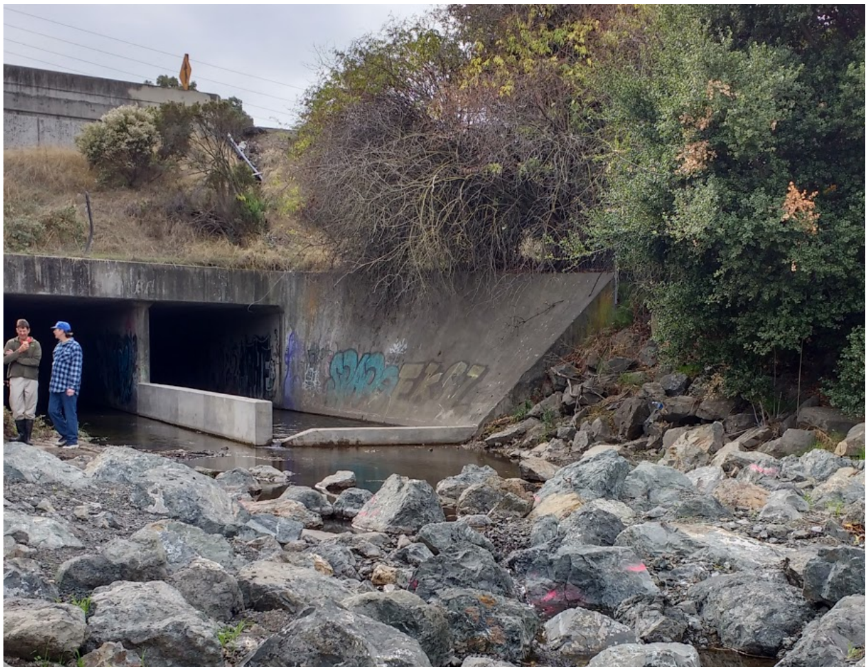
Pinole Creek Fish Passage Improvements at I-80 Culvert

This project sought to improve fish passage in Pinole Creek. Construction was successfully completed in 2016, for a design including a fish ladder, a curb at the downstream end of the culvert, and an engineered channel with rock weirs downstream. Post construction spawner surveys in 2017 and 2018 observed multiple redds built by steelhead and/or rainbow trout, indicating that the infrastructure is achieving its goal of providing passage for adult steelhead returning to spawn in Pinole Creek, upstream of the culvert. All financials and reporting requirements were completed for this project.