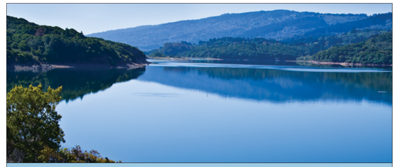
Crystal Springs Reservoir, visible from Highway 280, is part of a complex system of dams, reservoirs, pipelines, and tunnels that funnel snowmelt collected in Hetch Hetchy Reservoir near Yosemite into San Francisco via a largely gravity-fed system. In the Bay region, the system's facilities and lands encompass 59,000 acres under the stewardship of the San Francisco Public Utilities Commission. Twenty watershed keepers patrol these landscapes to protect them from fire, trespassers, and other threats to the purity and safety of the water supply of 2.6 million customers around the Bay Area.

Having grown up bucking wood and lifting hay bales, Ciardi was strong and capable. She conducted patrols on horseback and assisted local cattle ranchers with roundups. She fixed fences, removed victims of gang shootings and drownings, and battled wildfires until firefighters arrived. She chased trespassers at night, and confronted rifle-toting poachers with more outrage than fear. "I'd go, 'what