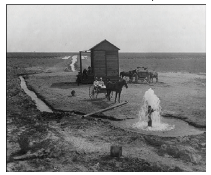
Kern County well circa 1890.

Critical to the competitiveness of California's farmers with industrialized agriculture elsewhere in the nation was the irrigating farmer's access to a cheap and self-replacing immigrant workforce. "They kept those laborers firmly under control decade after decade," writes Worster. "California's polyglot, wage-based version of the Egyptian corvées [unpaid labor]."