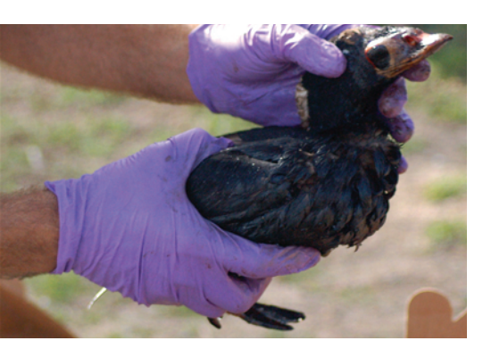
Oiled Scoter.

Four years after the Cosco Busan released 53,000 gallons of bunker fuel into San Francisco Bay, federal, state, and local agencies settled their suit against the vessel's owners and operators. The settlement package, a total of $44.4 million, contains dozens of proposals involving shoreline restoration and habitat enhancement for waterbirds and herring. Outlavs for recreation ($18.8 million) and wildlife and habitat ($11.5 million) raised some eyebrows. The settlement's draft Damage Assessment and Restoration Plan (DARP) also illustrates the challenges of managing migratory bird populations. Although surf scoters suffered more from the spill than any other species, the plan's developers were unable to identify a project to build up their numbers; instead, the trustee agencies will invite proposals.