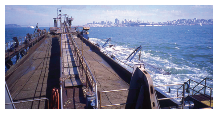
Sand mining dredge on the Bay.

Shifting Sand Math: Sediment transport and supply to the Bay came into the agency limelight again this January, when the Bay Conservation and Development Commission approved a new initiative to develop a regional sediment management strategy, partnering with sediment managers and scientists who work with flood channels, habitat restoration, watersheds, and aggregate mining. The meeting came on the heels of the State Lands Commission's re-issued November EIR on sand mining impacts, and a USGS study earlier in 2010—both of which contain complex technical computations that don't necessarily square up with each other in terms of assumptions about Bay sediment supplies and movements. MORE