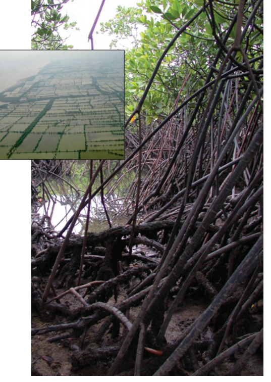
Natural mangrove forest. INSET: Mangrove deforestation.

Will carbon trading in wetlands happen soon? There are protocols for trees but they don't exist yet for wetlands. We're working on standards that would allow states, primarily California and west coast states, to trade through the climate action reserve. I can see this happening two to five years out.